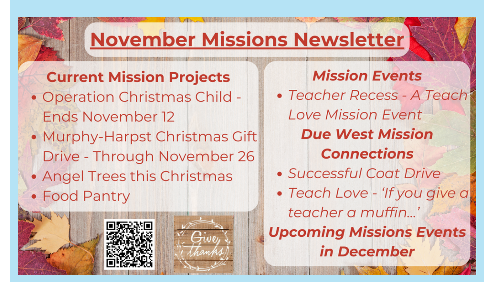
Missions Newsletter - November

There's so much going on for Missions this month! Check out our missions newsletter to learn more about all the churchwide mission projects we have going on here at Due West!